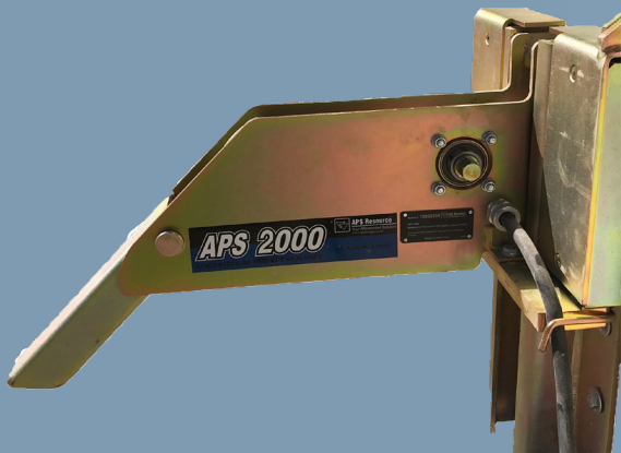
Figure 5: APS 2000 installation

This product carries a two (2) year limited warranty with APS Resource.