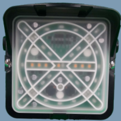
Figure 4: Low-Profile 6" x 6" Heavy-Duty Industrial Light Box