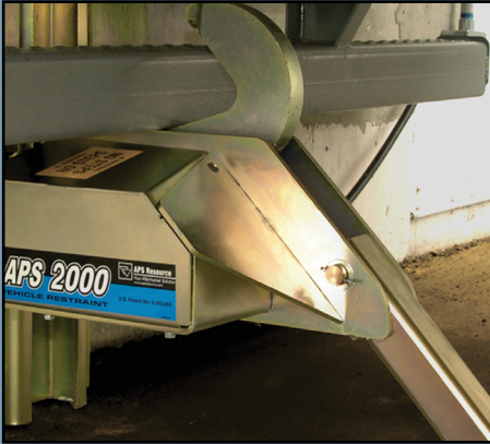
Figure 1: APS 2000 features rotating hook engagements