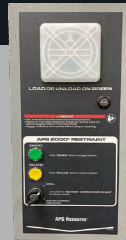
Narrow 9.5" x 21" Heavy-Duty Industrial Control Box