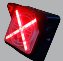
Universal Red and Green LED Lights/Symbols