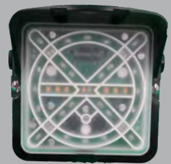
Low-Profile 6" x 6" Heavy-Duty Industrial Light Box