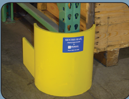
Figure 3: End of Rack Post Protector