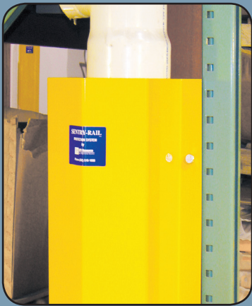
Figure 1: Drain Pipe Protector positioned over PVC pipe.