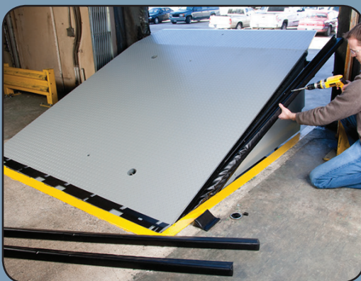
Figure 2: Energy Guard installation process

The ENERGY GUARD Retrofit Kit offers top of the line perimeter seal that covers the sides and rear of your dock leveler. The energy saving solution blocks invasive vermin and insects as well as debris. It can also be used as an extra security measure.