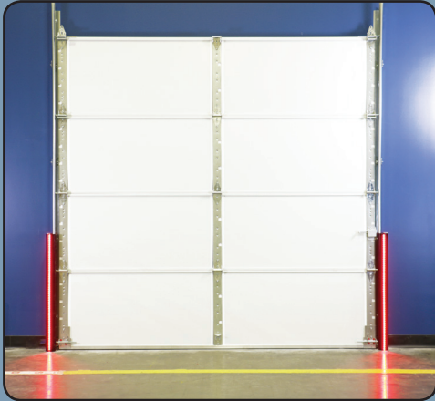
Figure 1: Impact-A-Track LED full installation

The Impact-A-Track LED is designed to protect door tracks in high traffic areas of warehouse against forklifts, pallet jacks and other equipment. It can be relied on to communicate restraint status and deflect impacts while utilizing only a small footprint of your active work area. This product comes packaged in a set of two.