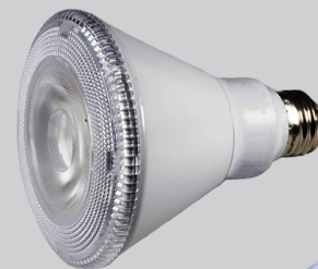
E Saver 30™ LED Lamp