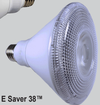
E Saver 38™ LED Lamp