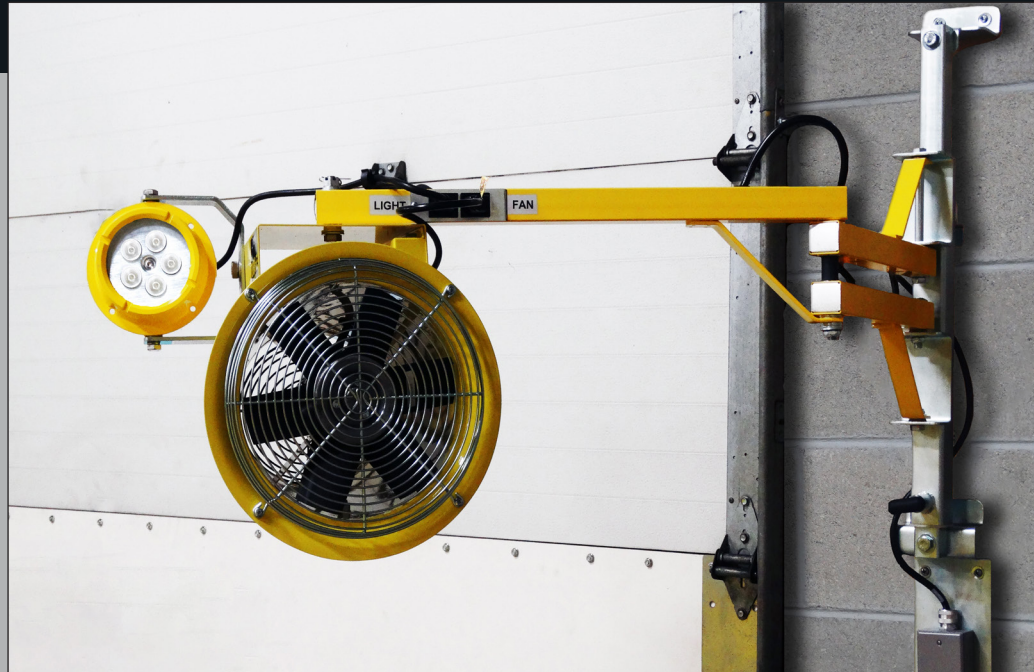
Heavy-Duty Adjustable Fan/Light