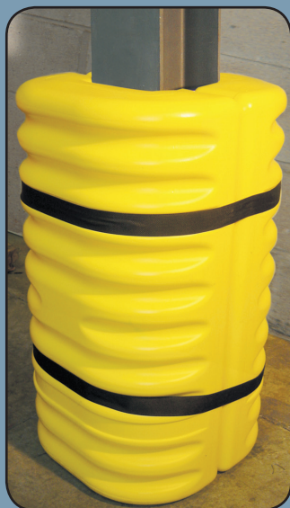
Figure 1: Poly-Barrel Column Protector

Column Protectors shield I-Beams from structural damage caused by impact from forklifts and other equipment.