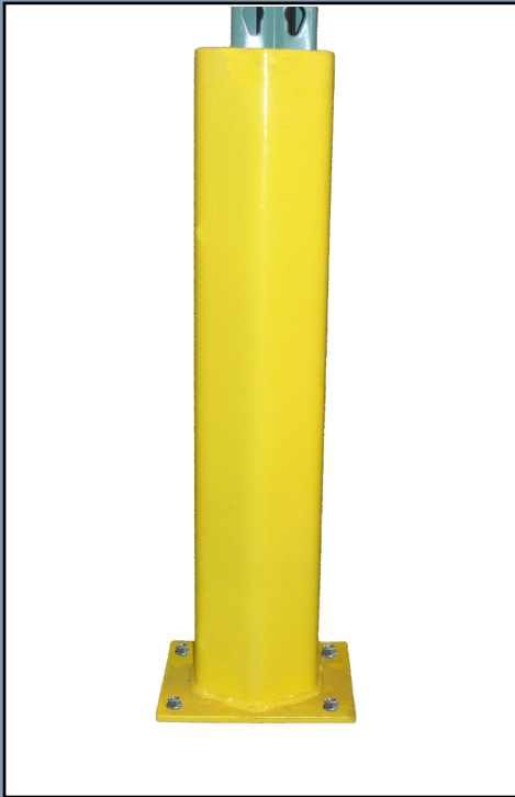
Figure 1: Post Protector

Rack Post Protectors are a cost-effective solution to protecting your racking systems from collapse during impact.